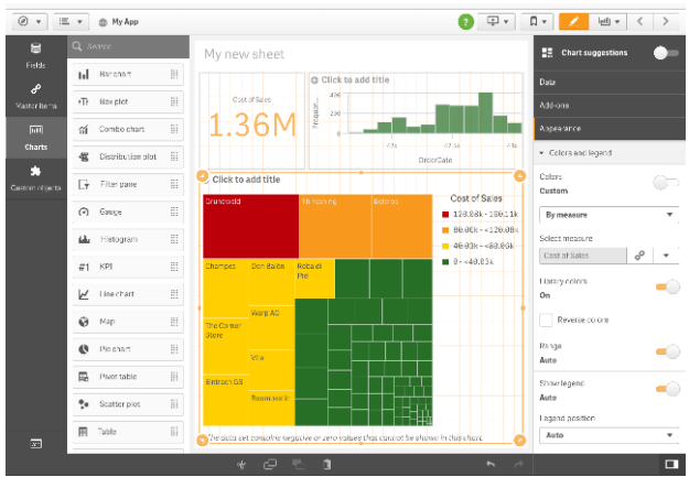
Fig. 3. Qlik Management Console

C. Qlik Sense, a modern analytics platform from Qlik, features a distinctive associative engine that allows users to freely explore data relationships without relying on rigid hierarchies. This engine highlights relevant data and grays out unrelated elements, accelerating insight discovery—particularly useful with large or real-time datasets. Qlik Sense supports real-time connections, offers an extensive set of visualization options, and provides robust ETL capabilities through its scripting environment. Designed for enterprise scale, its multi-node architecture, load balancing, and governance controls help ensure consistent data definitions and security across deployments. However, it can be more complex to implement and manage than tools like Tableau or Power BI, especially for organizations lacking Qlik expertise.