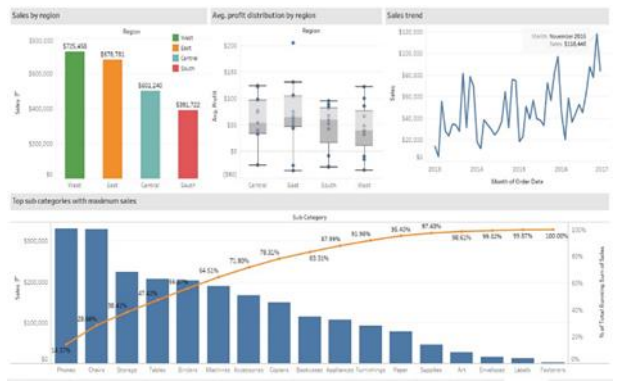
Fig. 1. Example of Tableau sales dashboard

A. Tableau is known for its intuitive drag-and-drop interface that makes data analytics accessible to a broad user base. It connects seamlessly with multiple data sources—from SQL databases to cloud-based platforms and real-time streams—allowing live or snapshot-based data updates. Tableau's robust visualization engine supports interactive charts, maps, and advanced calculations, with the "Show Me" feature simplifying dashboard creation even for newcomers [5]. Collaboration is facilitated through Tableau Server and Tableau Cloud, where teams can share dashboards, set permissions, and receive automated alerts. However, costs can rise in larger organizations, particularly if many users require full authoring capabilities.