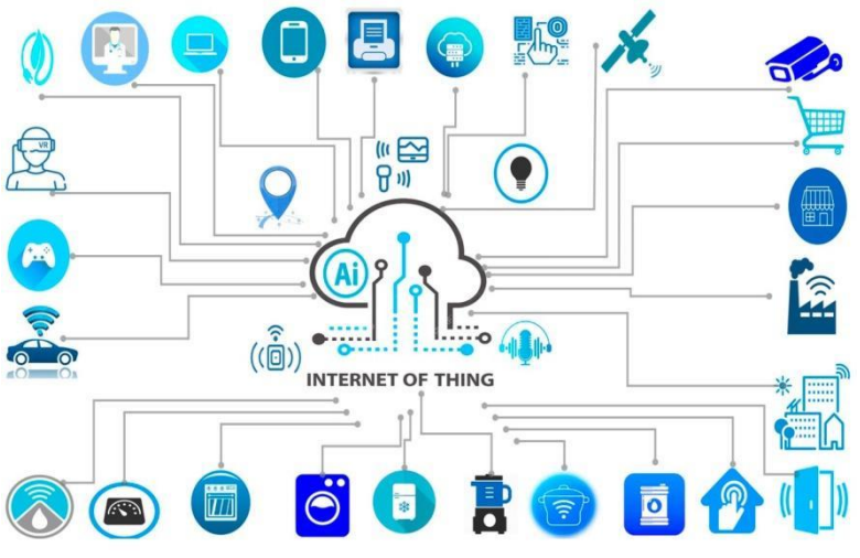
Fig.1. IoT connected with various devices [18]

IBM and Cloudflare emphasize the hardening of security by the Internet of Things : automation of threat detection, advanced data protection, and quick reaction in case of a DDoS attack. Both Schneider Electric and Siemens remain concerned with energy-efficient solutions developed via IoT that make data center operations greener due to lower cooling costs and higher asset utilization. Moving on from resource management and optimization, both Alibaba Cloud and Oracle utilize IoT technologies to further drive smart load balancing and data analytics for better resource allocation and service reliability. Companies such as Dell Technologies and Intel are using edge computing with IoT to improve upon data processing speed, latency reduction, and throughput improvement. Overall, these use cases show how IoT helps in modernizing data centers in the most efficient way to reach optimal energy use, improve security, and enhance operational efficiencies that yield cost savings and a more environment-friendly approach toward data handling.