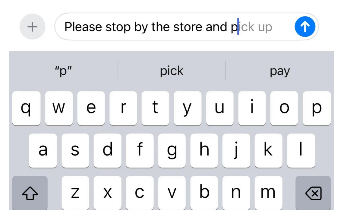
Fig. 2 Inline predictive text suggestions. Adapted from [6]

AI-driven systems can now learn a user's typing habits over time, adapting to their preferences, including commonly used phrases, slang, and abbreviations. For example, AI can predict email sign-offs or automatically suggest relevant responses in a messaging app, improving the overall efficiency of communication on tablets. Additionally, the use of predictive text extends to voice-to-text capabilities, where AI enhances the accuracy and speed of transcription [5].