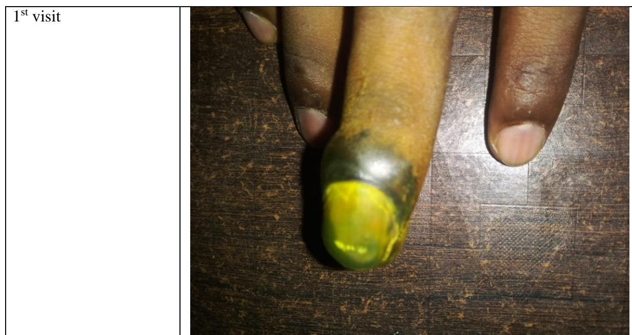
Table 1: Follow up pictures