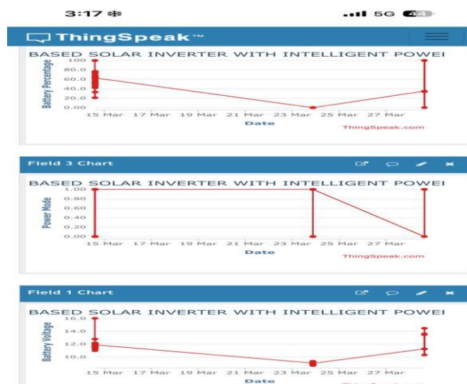
Fig3. IoT real time monitoring