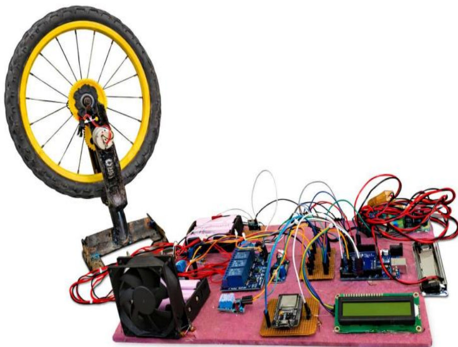
Fig. 2 Hardware Setup of the Proposed System

The hardware implementation of the proposed system is designed to effectively recover, regulate, and store energy generated during braking conditions while ensuring reliable operation. The overall hardware setup of the system is illustrated in Fig. 2, which includes a Permanent Magnet DC (PMDC) motor, a DC-DC boost converter, an Arduino UNO, relay modules, dual battery units, voltage and temperature sensors, a cooling fan, and an ESP32 module for IoT-based monitoring.