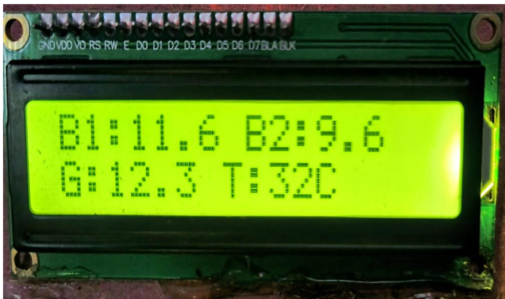
Fig. 3 LCD Display Showing Battery Voltages, Generated Voltage and Temperature

The developed system provides real-time monitoring of important parameters using a 16×2 LCD display. The LCD displays the voltage levels of both batteries, generator output voltage, and the temperature measured using the DHT11 sensors.