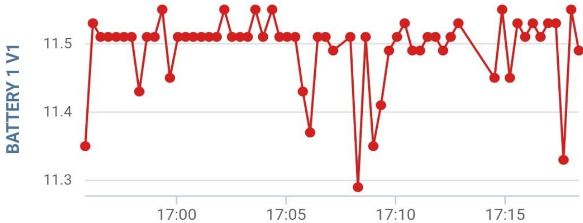
Fig. 5 Battery 1 Voltage Monitoring Graph

The variation of Battery 1 voltage over time is shown in Fig 5.